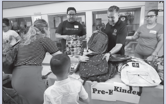
Senator Blanco hands out a free backpack at his annual Back-to-School Backpack Giveaway.