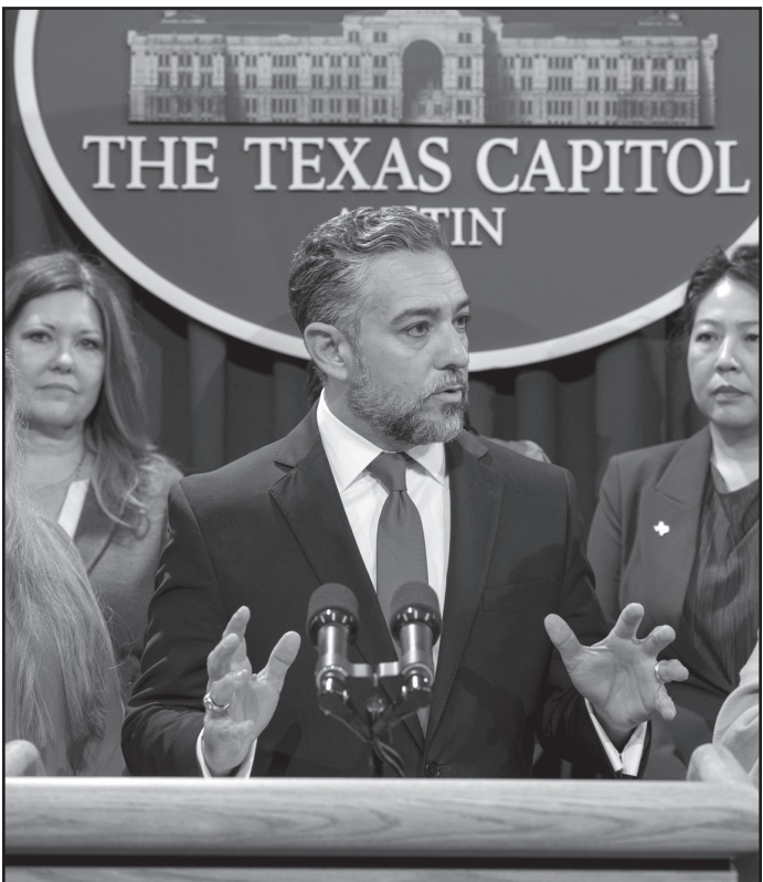
Senator Blanco leads a press conference on Senate Bill 9-1-1, the HEAL Texans Act to expand access to quality healthcare.

I proudly sponsored HB 1052 to make sure your care follows you, not the other way around. Starting Sept. 1, if you live in Texas and your doctor practices here, your telehealth visits will be covered, even if you're traveling out of state. That's a big win for rural Texans, seniors, caregivers, and anyone who depends on virtual care.