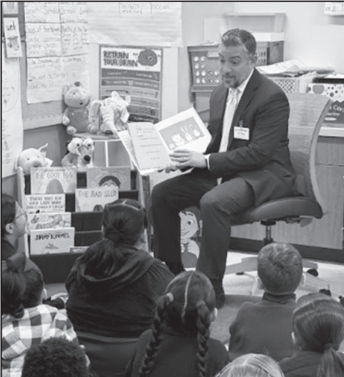
Senator Blanco reads to a class of students at Scotsdale Elementary School.