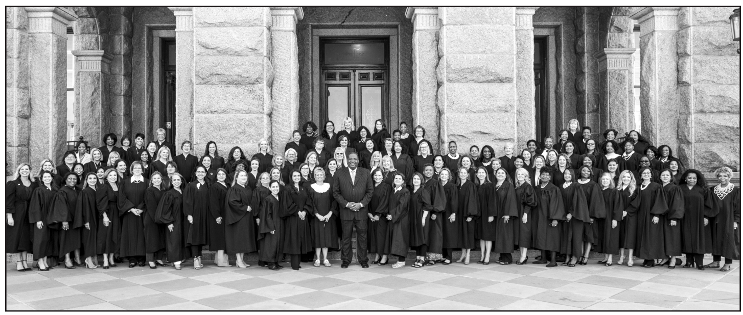
In April, women judges from across Texas were invited to the Capital for recognition by Sen. West.

While we provided free pre-K under HB3 , obstacles still exist, including the requirement that families who are eligible for 3-year-old pre-K must re-establish eligibility for their 4 year-olds to attend. But many times, the family's information has not changed.