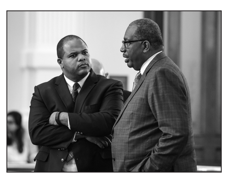
Sen. West chats with Rep. Eric Johnson who was later elected Dallas Mayor.

Under HB3 , school taxes paid by property owners will decrease by 7-8 cents per $100 valuation in 2020 and by 13 cents in 2021. For a $200,000 home, this should reduce school property taxes by about $160 per year. Critics say HB3 benefits corporate and upscale property owners more than it does average homeowners and does nothing for renters.