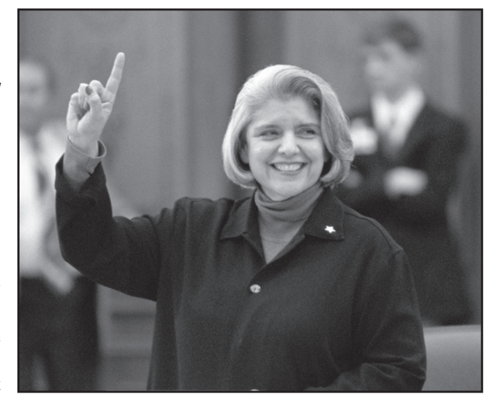
There is no greater honor than working passionately in the Texas Senate on behalf of the families of Senate District 21.

Perseverance was a necessary virtue during the 82<sup>nd</sup> Texas Legislative Session as the state faced an estimated $27 billion budget shortfall. While I fear that the budget passed by the Legislature relies too heavily on cuts, I am proud to have worked collaboratively to minimize their impact on Texans, especially the very old, the very young and persons with disabilities.