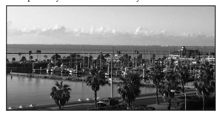
View of the Corpus Christi bay in Nueces County, Senate District 20.

Another critical piece of legislation for the coast came with Windstorm Insurance Reform. I worked with my colleagues to ensure that our families have access to affordable and accessible windstorm insurance coverage with a strong funding structure and an increased level of transparency and accountability.