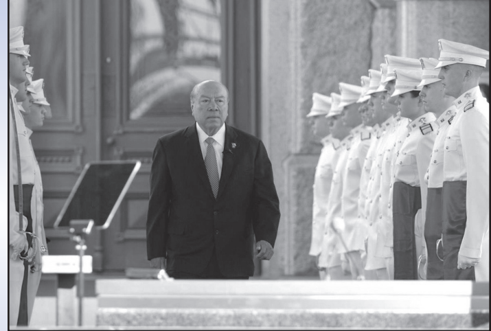
SENATOR HINOJOSA SERVED AS "GOVERNOR FOR A DAY" AND SENATE PRESIDENT PRO TEMPORE OF THE TEXAS SENATE IN THE 84TH TEXAS LEGISLATURE, SERVING AS THE PRESIDING OFFICER OF THE SENATE IN CASES OF THE LT. GOVERNOR'S ABSENCE.