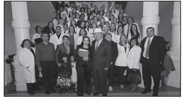
Senator Juan "Chuy" Hinojosa visiting with South Texas nurses and nurse practitioners who are working to improve access to healthcare for all our Texas families.

SB 207 which I authored, reforms the Office of the Inspector General (OIG) as it relates to investigations of fraud or abuse by medical providers in connection with the Medicaid program. While we need to detect and prevent fraud and abuse in the Medicaid system, we must also give our providers due process and increase transparency of the OIG investigative process. This legislation outlines clear criteria for fraud investigations, including clarifications that fraud does not include unintentional clerical or administrative errors.