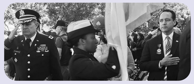
Thank you to all our veterans for your service to our country!