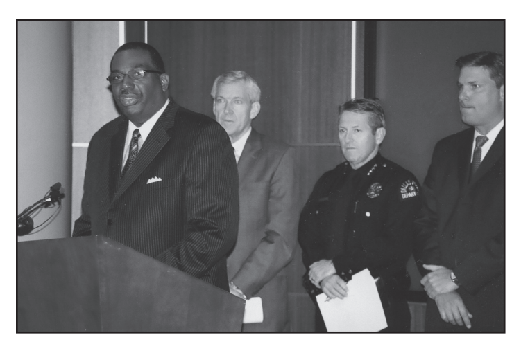
Sen. West joins Dallas Mayor Tom Leppert and Police Chief David Kunkle for press conference to address metals thefts at police headquarters.

After much legislative wrangling, I was able to pass a bill that has already begun to change how the sales and purchases of metals such as copper, brass, bronze and aluminum are reported in Texas. Unfortunately, those changes have not been as swift in implementation as the thieves who have made life miserable for many homeowners, businesses and even churches who have had their air conditioning, construction and building materials and now even catalytic converters pilfered for cents on the dollar.