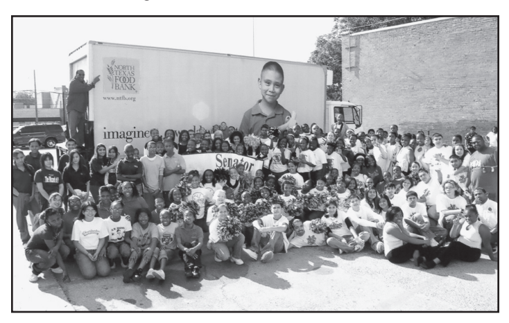
Sen. West (pictured top left) hosts students from District 23 schools as part of Nov. 2007 Student Advisory Committee food drive benefiting the North Texas Food Bank.

Are loan packages chockfull of hidden or unwarranted fees? Do borrowers really understand what they are signing? Do borrowers realize what it means in dollars when their terms say the interest can increase to a rate as high as 14 percent? And how many borrowers have been shoved into subprime/ARM loans when they actually qualify for prime, fixed-rate loans? Although federal help is on the way, relief for Texas homeowners cannot come fast enough!