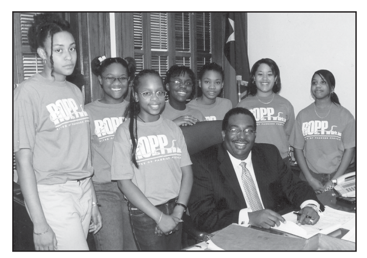
Senator West meets with local schoolchildren in his capitol office.

abuse because of their fear of being made homeless. The passage of my Senate Bill 92 will prevent landlords from