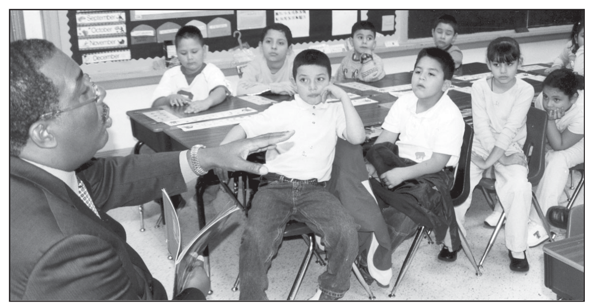
Senator West discusses the significance of M.L.K. Day with children at Lida Hooe Elementary.

I also worked to resolve the frequent conflicts that occur between neighborhood groups and affordable housing developers. As a result of these discussions, developers agreed to increase their application fees to fund studies on ways to Continued on page 5