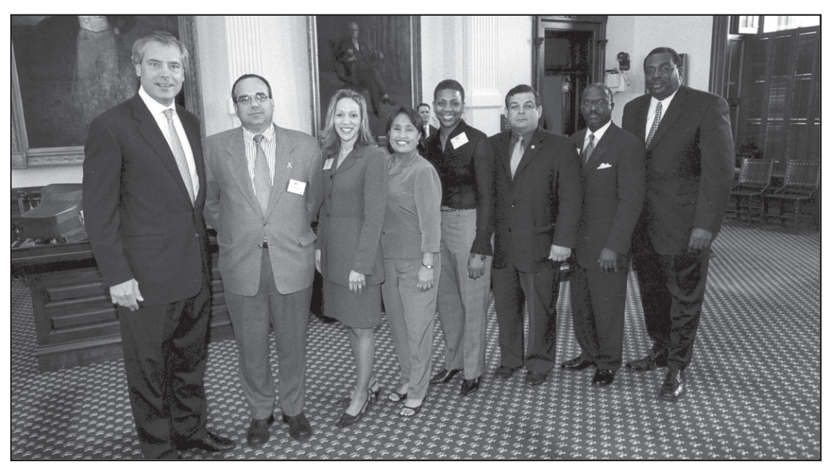
Senator West introduces minority business leaders to Lieutenant Governor David Dewhurst.