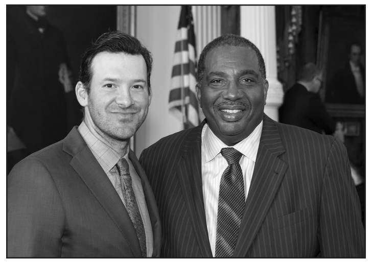
Retired Dallas Cowboy Quarterback Tony Romo was a visitor to the Texas Capitol.

In 2015, I authored SB1462 which became law to allow those close to persons suffering from opioid addiction to obtain a prescription for the drug naloxone, an opioid antagonist, from pharmacists without a prescription and without issuer liability. With opioid overdoses having quadrupled since 1999 and the issue a matter of daily discussion, I was able to write SB584 as follow-up legislation this session. About half of all opioid overdoses are produced by prescription drugs. The bill requires the state medical board to develop guidelines, along with the pharmacy board, to allow an opioid antagonist to be prescribed to at-risk patients alongside the opioid prescription.