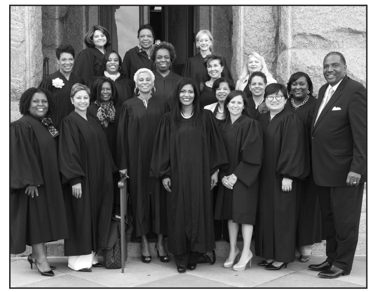
April 4, 2017 was Texas Women Judges Day at the Capitol. Dallas County Women Judges were recognized on the Senate floor by Sen. West.

Texas will spend about $1.1 billion less on public schools next biennium than we did in the 2016-17 budget. It is why citizens are in an uproar over rising property taxes with more of the burden of funding schools being pushed to counties while the state's share of support continues to trend downward, now at less than 40 percent. With the Texas Supreme Court's 2016