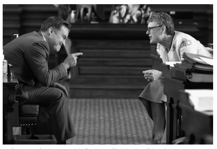
Senator Gutierrez with Senator Eckhardt of Austin.

The budget is the only bill required by the Texas Constitution to be passed by our Legislature each session. The 87th Legislature passed a $248 billion budget, allocating $116 billion in revenue toward government operations and programs. This budget signals a $13.5 billion reduction in overall spending from last session's budget. The budget allocates roughly $8.6 billion toward higher education, ensuring that Texas universities will continue to build the brightest minds of tomorrow.